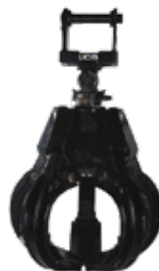
ORANGE PEEL GRAB